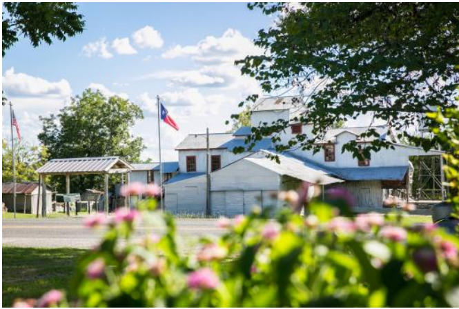
Cotton Gin Museum (Burton)