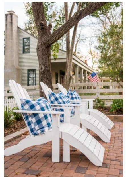
Downtown (Chappell Hill), Annual Art Walk (Chappell Hill) and Cottage Blue on Main (Chappell Hill)