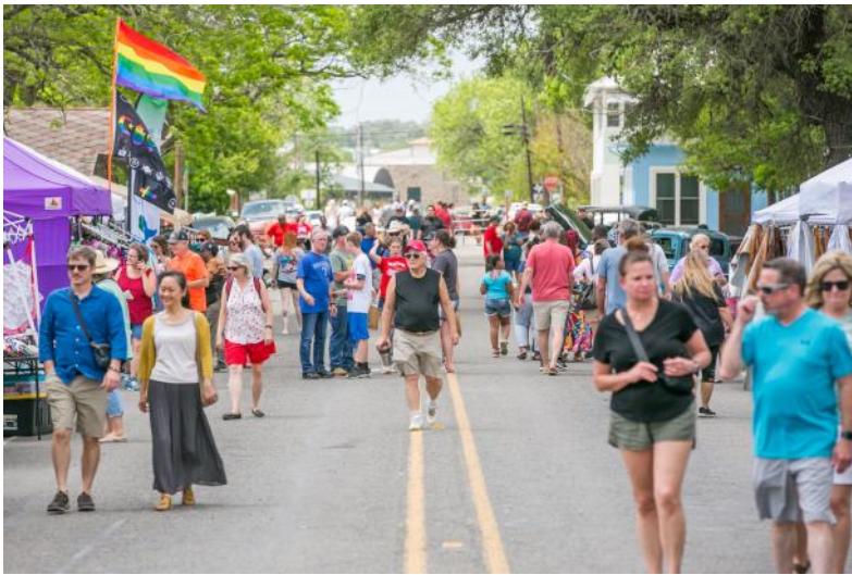
Downtown (Burton)