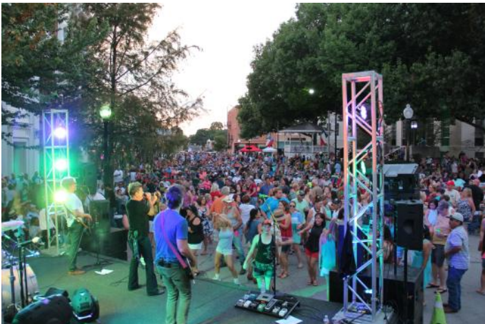
Hot Nights, Cool Tunes (Brenham)

If we want our downtown to thrive, we must all take ownership of downtown as part of our DNA or community identity. Our downtown must be walkable so that residents and visitors can easily manage the pedestrian-friendly sidewalks. Parking throughout the district should be available along with various diverse economic uses like retail, dining and cultural spaces. Adding an element of green space improves aesthetics but also contributes to community well-being and environmental sustainability. Family-friendly spaces that encourage multi-generational use of the downtown area should be included and can be accomplished through community events, festivals and activities that draw people.