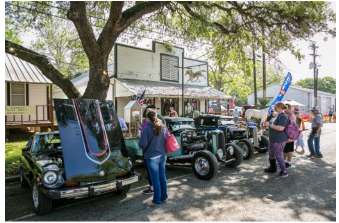
Car Show (Burton)