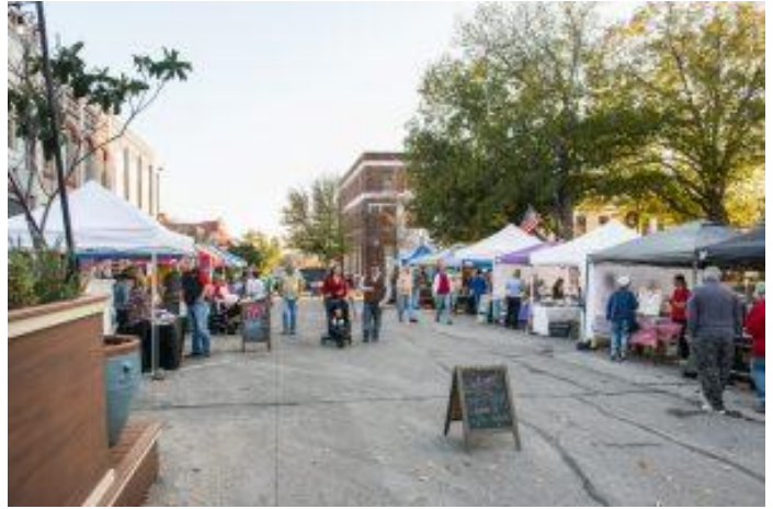
First Friday Farmer’s Market (Brenham)