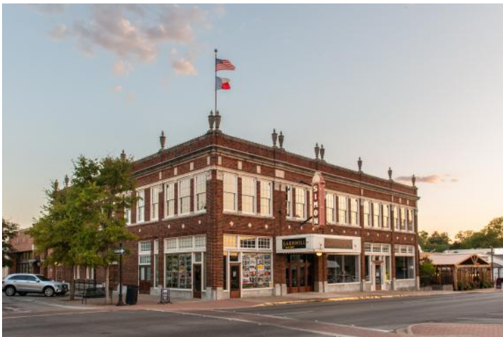
The Barnhill Center (Brenham)

Main Street America is an organization that is