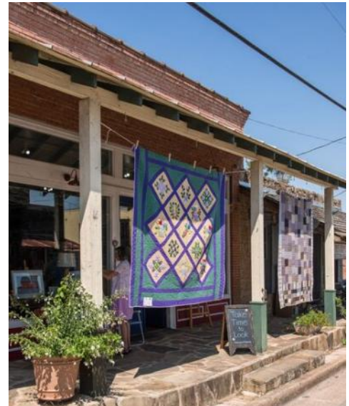
Annual Airing of Quilts (Chappell Hill)