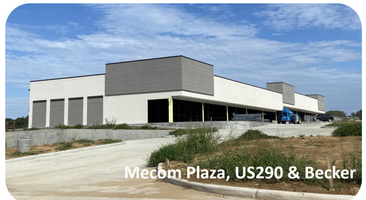
Mecom Plaza, US290 & Becker